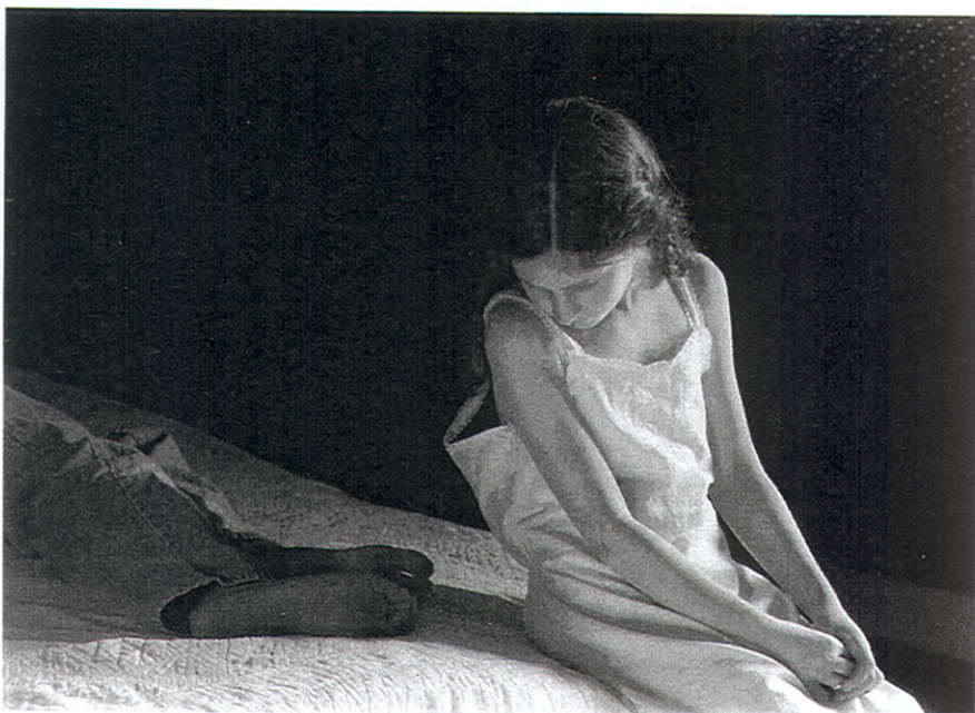
Rita Bernstein: Untitled from the Domestic Landscape series

Taken together, Bernstein's photographs form a single vision that isn't limited to childhood. They speak to all of us about exclusion, vulnerability, rejection, and tenderness.