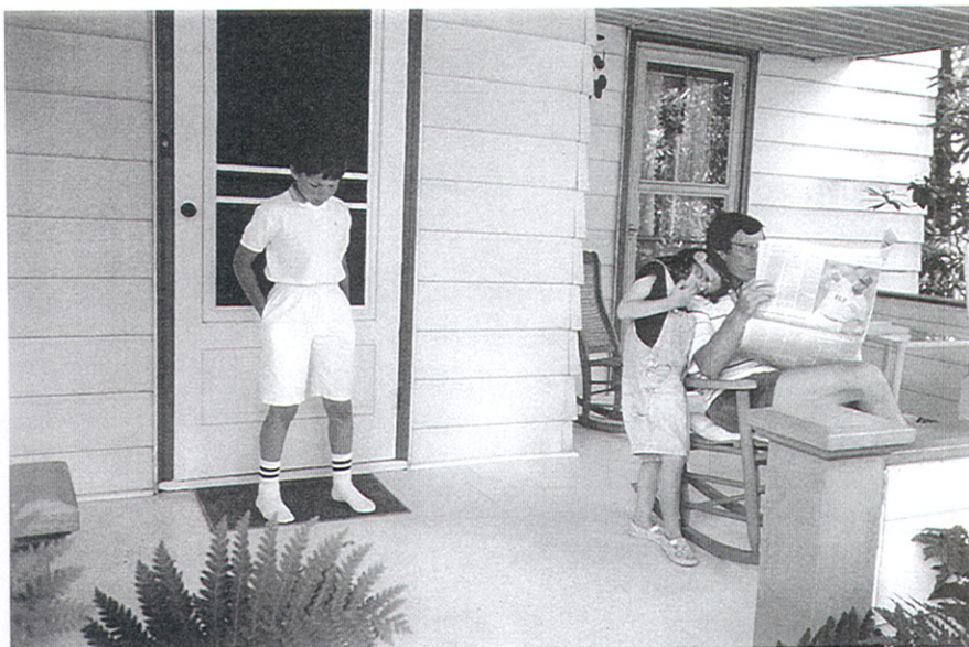
Rita Bernstein: Untitled from the Porch Life series

condition. Strikingly reminiscent of Daumier's The Third-Class Carriage , this image catches a familiar scene: a child sleeping on the train. But as you study it closely, what at first seems a charming picture takes on a disturbing air. You begin to wonder: Where is the mother? Is the man who sits nearby indeed the child's father?